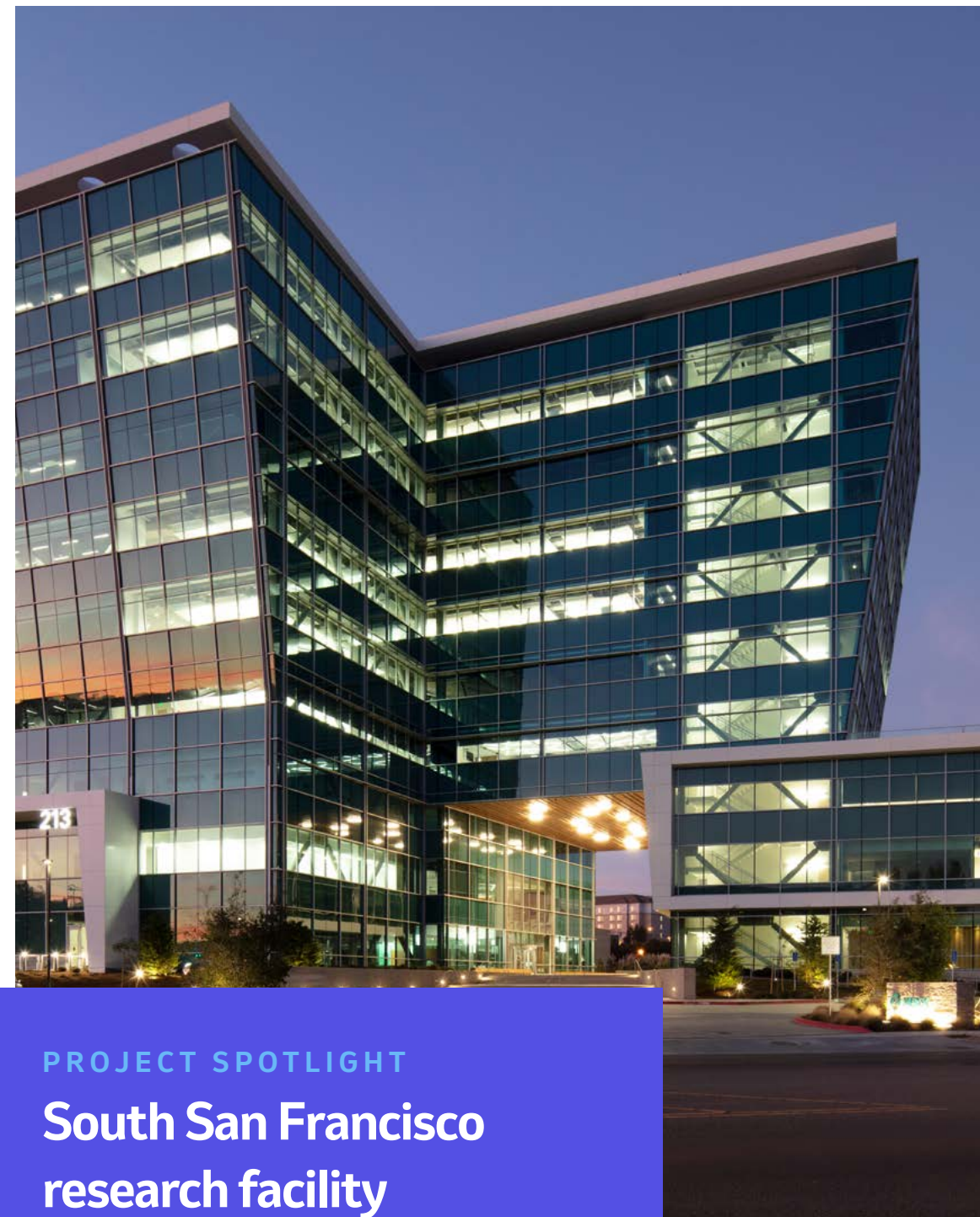
PROJECT SPOTLIGHT South San Francisco research facility

Sustainability bond proceeds were allocated to our new research facility in South San Francisco, a nine-story, 290,000+ square-foot tower, completed in 2019, and designed to optimize environmental sustainability. The building has earned LEED Gold ratings for core and shell and commercial interiors and is our first site to achieve LEED Zero certifications for net-zero carbon emissions and energy use. Energy modeling during design predicted it to be 23% more efficient than a conventional