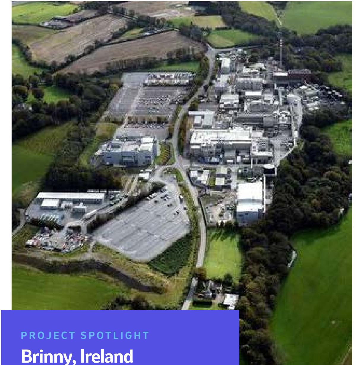
PROJECT SPOTLIGHT Brinny, Ireland

Sustainability bond proceeds were allocated to our Brinny, Ireland, manufacturing site. From 2019-2021, the wastewater treatment plant (WWTP) at our Brinny site was improved to handle new waste streams resulting from the existing infrastructure reaching its end of life. In addition to addressing these environmental risks, the project had environmental and innovative benefits. A recycled water system to reuse final effluent for rinsing cycles was introduced resulting in an average reduction of 25% of daily water withdrawal. Dynamic pH monitoring now enables precise adjustments to chemical dosing, reducing chemical use.